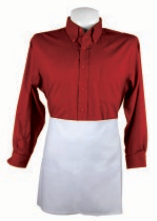
4 Way Apron

Bib, 4-way, and bistro aprons can be manufactured in many sizes and pocket configurations within five working days. INQUIRE ABOUT OUR CUSTOM CAPABILITIES. Most custom aprons are manufactured and shipped within 5-7 working days! Please contact your Venus territory manager for more information.